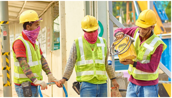
COVID-19: Advisories for Various Sectors