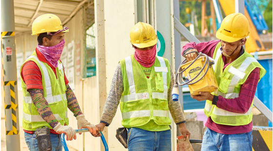
COVID-19: Advisories for Various Sectors