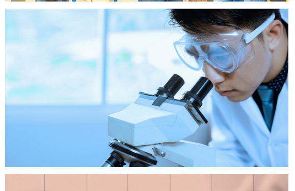
Expanded testing in Phase 2, steady progress in dormitory clearance