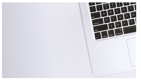
COVID-19: Updates and announcements