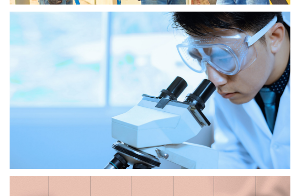
Expanded testing in Phase 2, steady progress in dormitory clearance