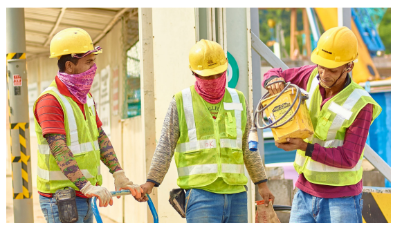
COVID-19: Advisories for Various Sectors