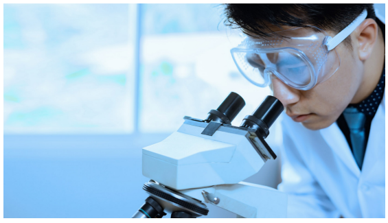
Expanded testing in Phase 2, steady progress in dormitory clearance