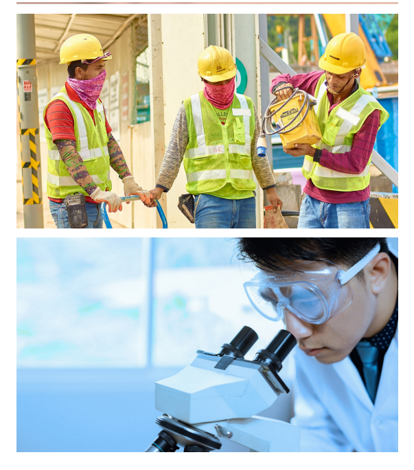
COVID-19: Advisories for Various Sectors

Expanded testing in Phase 2, steady progress in dormitory clearance