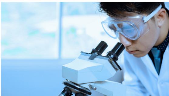
Expanded testing in Phase 2, steady progress in dormitory clearance