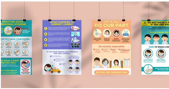
COVID-19: Advisories for Various Sectors