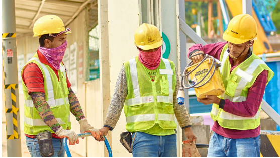
Expanded testing in Phase 2, steady progress in dormitory clearance