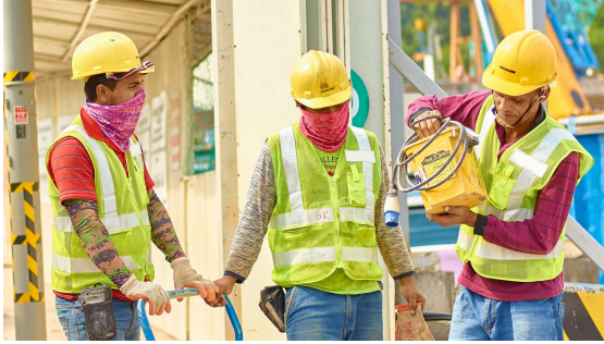
COVID-19: Advisories for Various Sectors