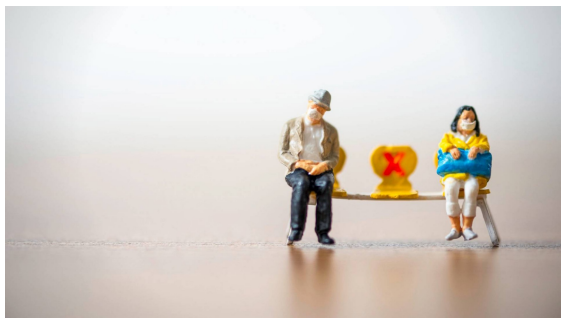
An update on community cases, controls of COVID-19 infection in Phase 2