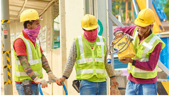
COVID-19: Advisories for Various Sectors