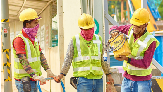
COVID-19: Advisories for Various Sectors