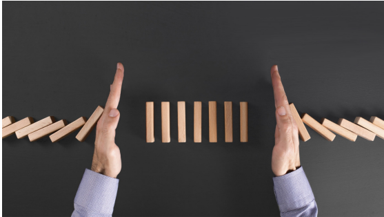
COVID-19: Keeping our guard up to avoid a resurgence of cases