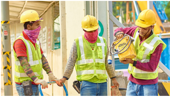
COVID-19: Advisories for Various Sectors