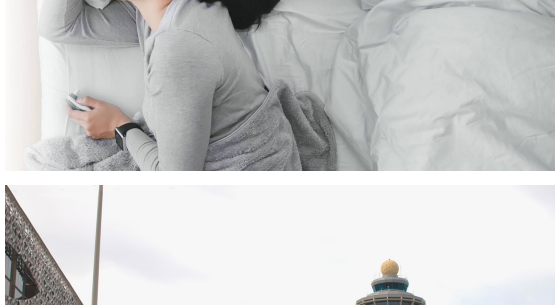
Cost of SHN stays, swab tests, and medical expenses when you travel

What should you do when you have dengue?