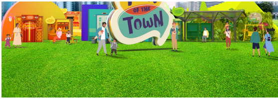
Catching the Digital Wave