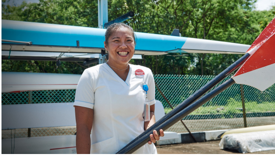
Standing by her patients and an Olympic dream