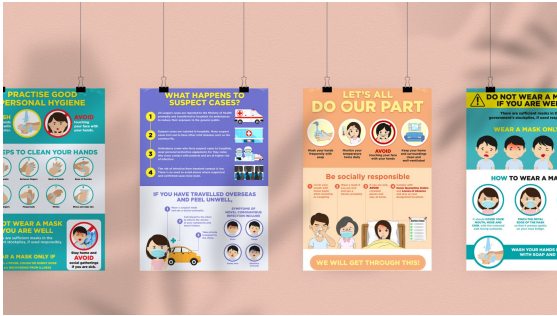
Roadmap to Phase 3