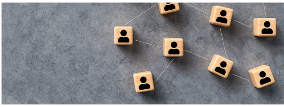
COVID-19: Updates and announcements