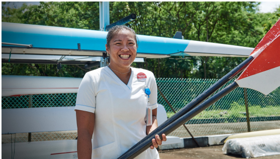
Standing by her patients and an Olympic dream