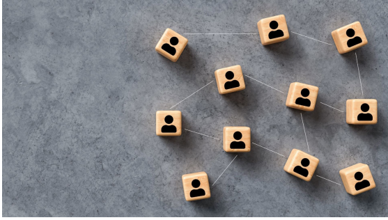
Public Places Visited by Cases in the Community during Infectious Period