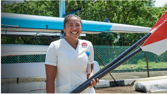
Standing by her patients and an Olympic dream

Is this page useful? Yes • No Is there anything wrong with this page?