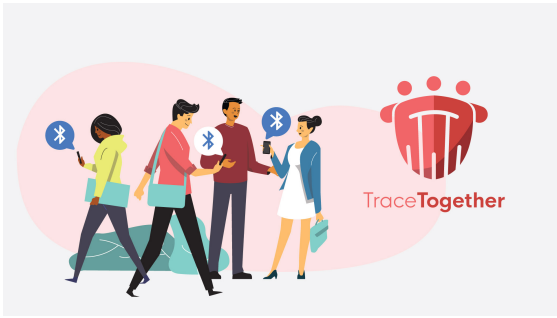
Roadmap to Phase 3