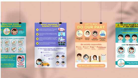
Roadmap to Phase 3