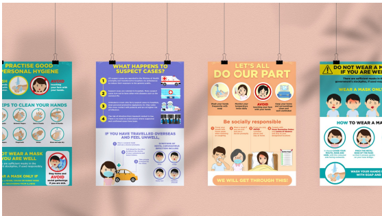
Roadmap to Phase 3