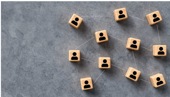
Public Places Visited by Cases in the Community during Infectious Period