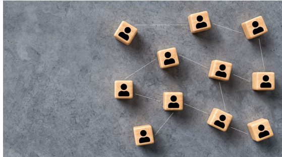
Public Places Visited by Cases in the Community during Infectious Period