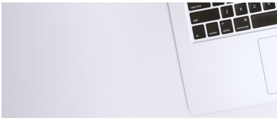
Public Places Visited by Cases in the Community during Infectious Period