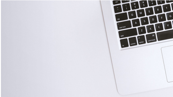
COVID-19: Updates and announcements