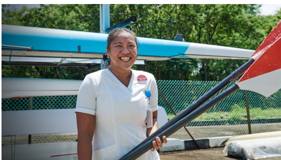
Standing by her patients and an Olympic dream