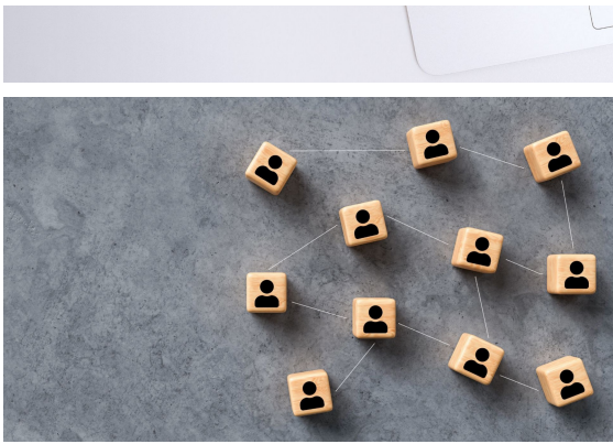
Public Places Visited by Cases in the Community during Infectious Period