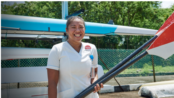
Standing by her patients and an Olympic dream