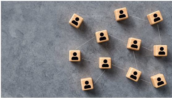
Safeguarding Lives and Livelihoods