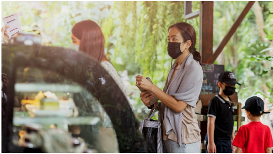
Safeguarding Lives and Livelihoods