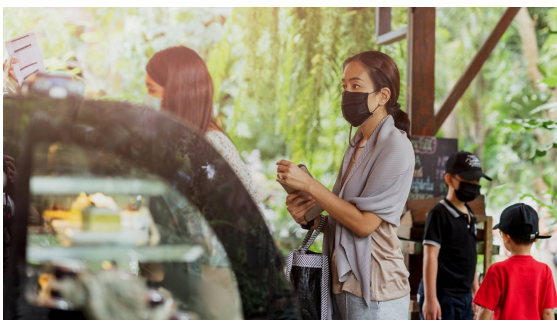
Safeguarding Lives and Livelihoods