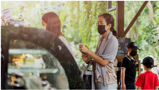
Safeguarding Lives and Livelihoods