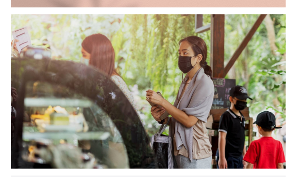
Safeguarding Lives and Livelihoods