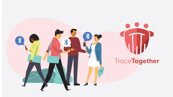
Roadmap to Phase 3