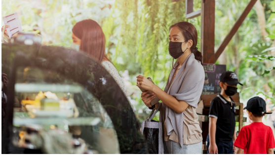
Safeguarding Lives and Livelihoods