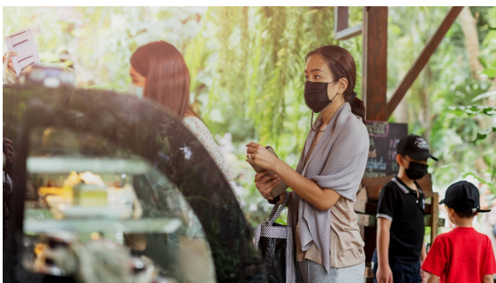
Safeguarding Lives and Livelihoods