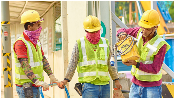
COVID-19: Advisories for Various Sectors