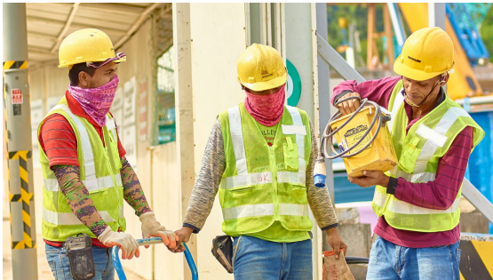
COVID-19: Advisories for Various Sectors