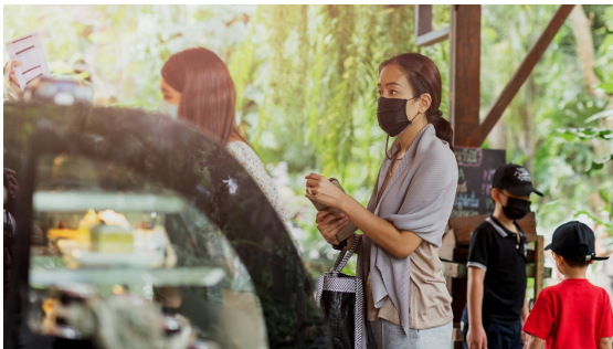
Safeguarding Lives and Livelihoods