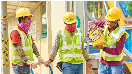
COVID-19: Advisories for Various Sectors