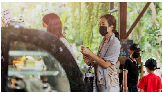
Safeguarding Lives and Livelihoods