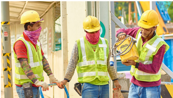
Safeguarding Lives and Livelihoods