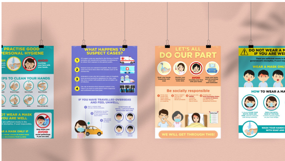
COVID-19: Advisories for Various Sectors