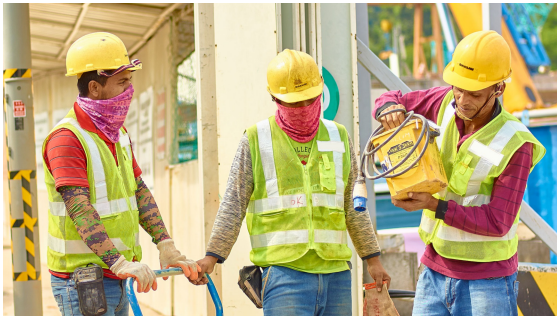
COVID-19: Advisories for Various Sectors