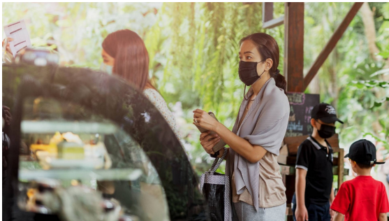
Safeguarding Lives and Livelihoods