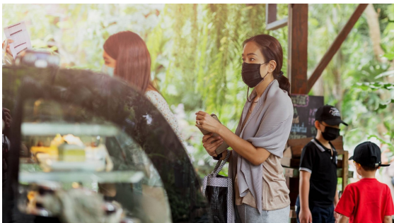
Safeguarding Lives and Livelihoods