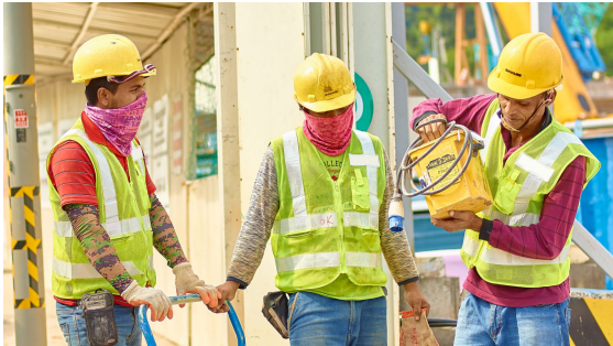
COVID-19: Advisories for Various Sectors