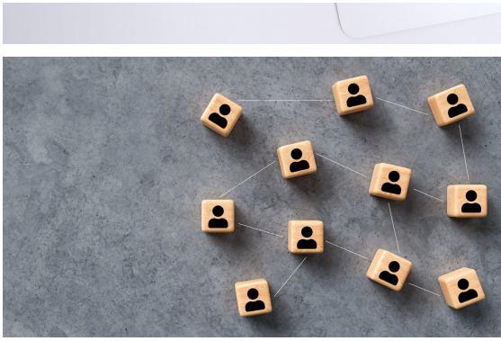
Public Places Visited by Cases in the Community during Infectious Period