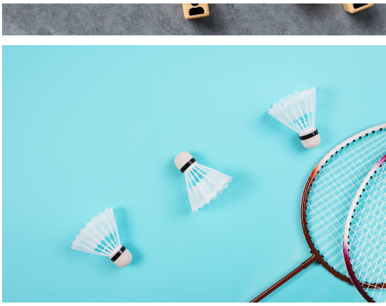
Gov.sg How-Tos: How to bring sport back safely