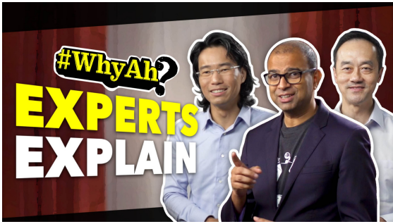
Experts Explain: COVID-19 and safe management measures