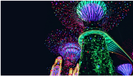
How to stay safe over the holidays