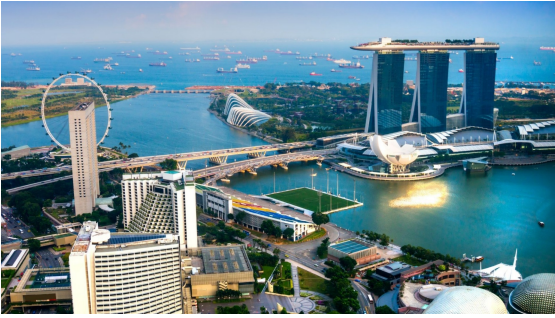
PM Lee: the COVID-19 situation in Singapore (14 Dec)