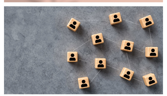
Public Places Visited by Cases in the Community during Infectious Period