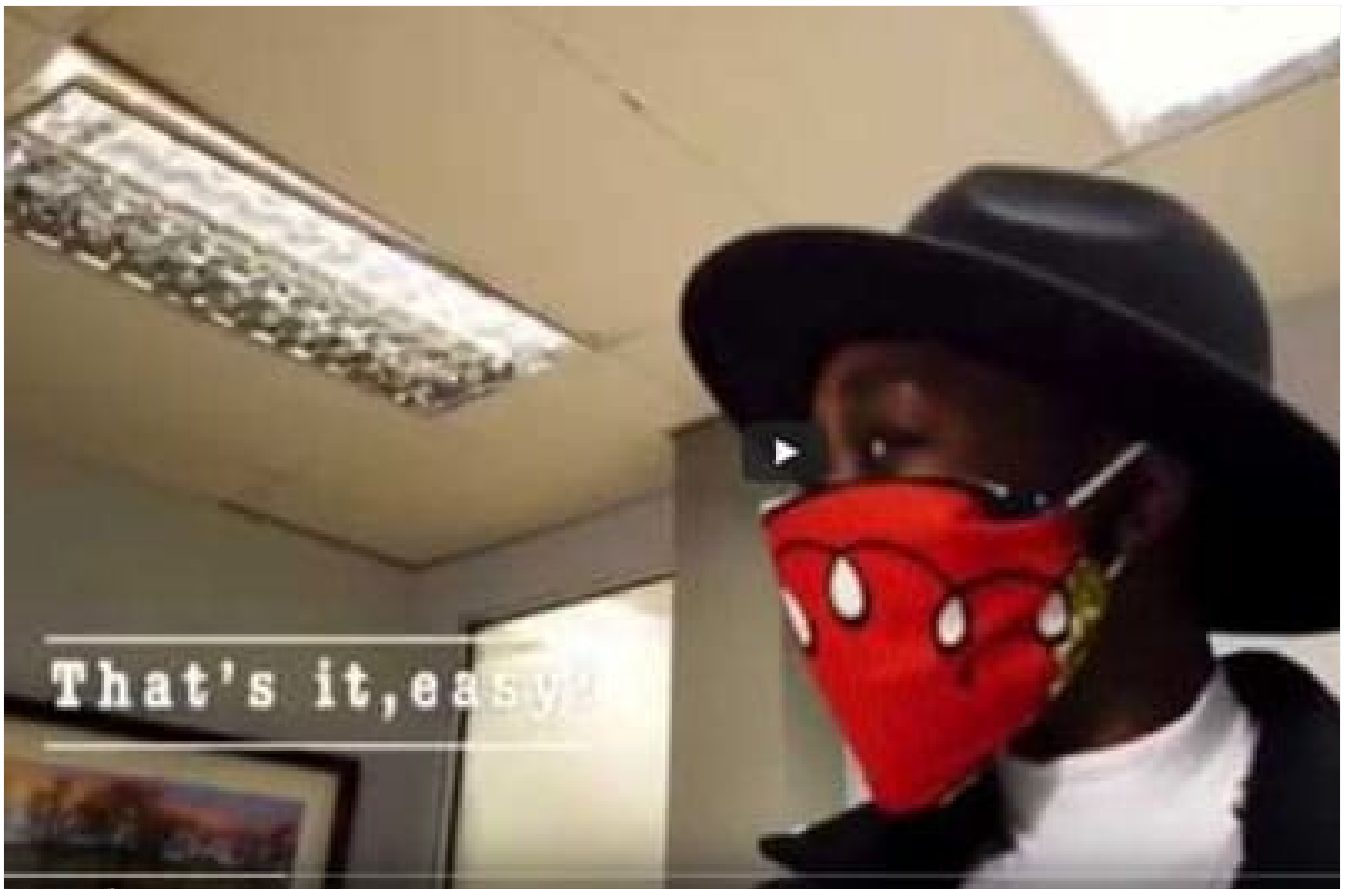
Video: How to make your own cloth mask