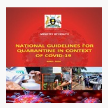
NATIONAL GUIDELINES FOR QUARANTINE