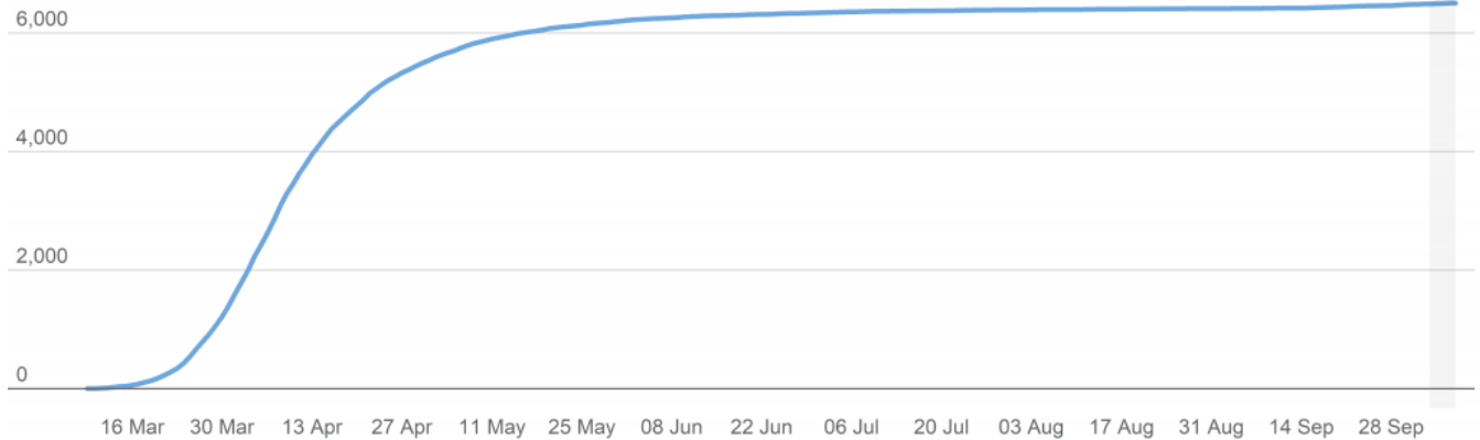
Source: NHS England COVID-19 Daily Deaths Includes deaths with no positive test from 25 April Note: Recent data (shaded region) is likely to be revised upwards Graphic by GLA City Intelligence