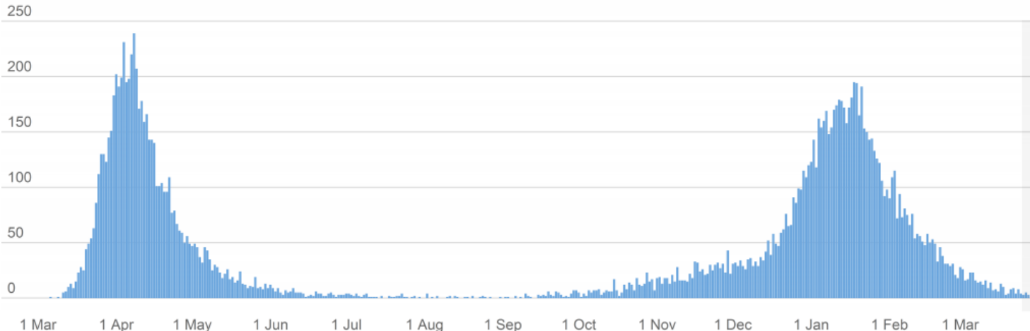
Daily COVID-19 deaths in London hospitals by date of occurrence

Note: Recent data (shaded region) is likely to be revised upwards Graphic by GLA City Intelligence