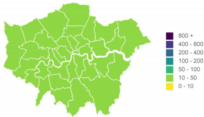
Source: PHE COVID-19 Dashboard Graphic by GLA City Intelligence Note: Colour scale has been adjusted due to low rates