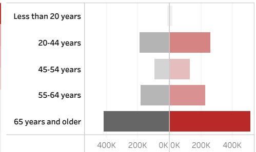
People who have received at least one dose by age and gender (■ male ■ female)