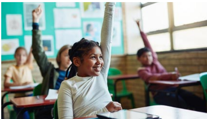
Schools & Childcare