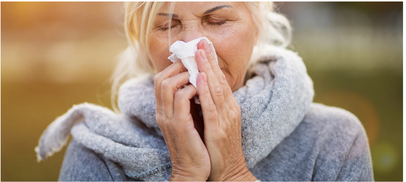
Older Adults & Medical Conditions