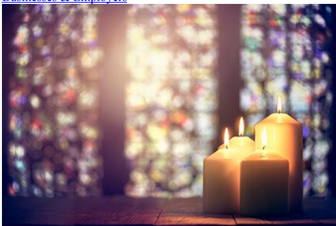
Community & Faith-Based Organizations View More